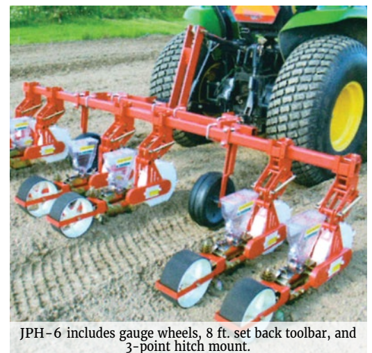
JPH-6 includes gauge wheels, 8 ft. set back toolbar, and 3-point hitch mount.