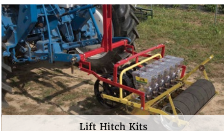
Lift Hitch Kits

Please allow 7-10 business days for delivery. All seed rollers sold separately. See next page.