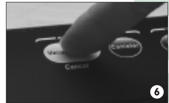
Press Vacuum & Seal Button