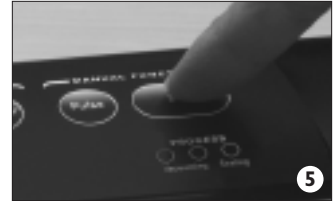
Press Seal Button