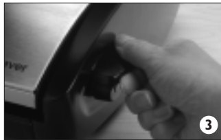
Close and Latch Lid