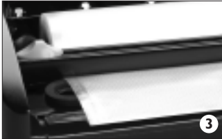
Place Bag Material on Sealing Strip