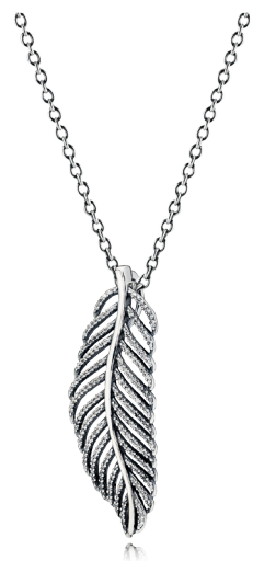
...to create your own NECKLACE