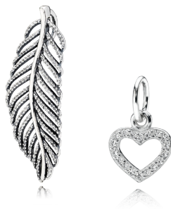
Combine with a beautiful PENDANT...