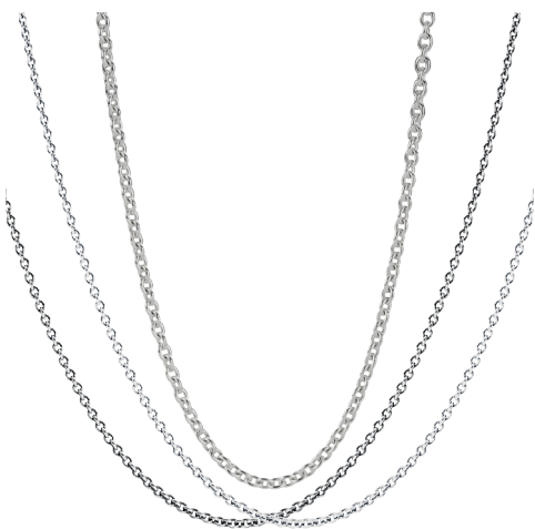
Choose your favourite CHAIN