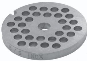
7505106 - 6 mm Grinding Plate