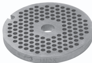
7505103 - 3 mm Grinding Plate