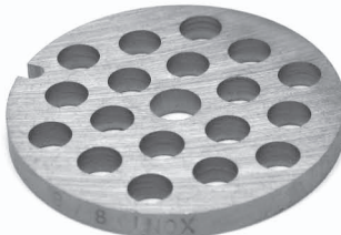
7505108 - 8 mm Grinding Plate