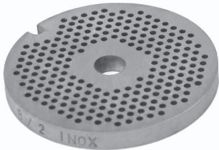
7505102 - 2 mm Grinding Plate