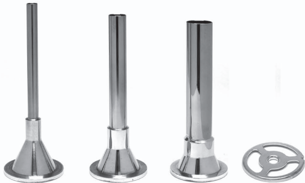
7505000 - Set of 3 Metal Sausage Stuffers - 12mm, 20mm, 30mm with Guide Disk