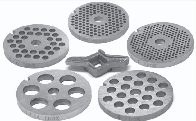
7505001 - Set of 5 Grinding Plates with 2 - Knife Blade for Grinder