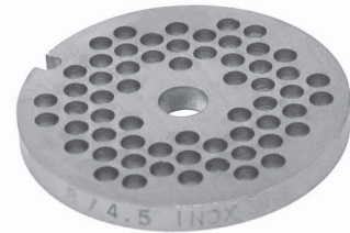
7505104 - 4.5 mm Grinding Plate