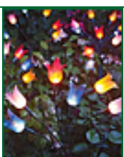
Garden Decor Sale