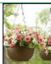
Pots and Planters Sale