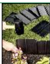
Edging and Mulches Sale