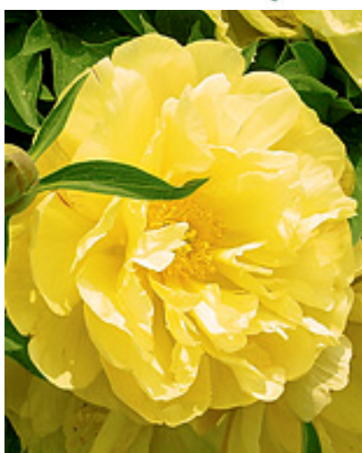
Singing in the Rain Peony

Peonies are one of the best-known and most dearly loved perennials. This is hardly surprising considering their sumptuous beauty and fragrance, trouble-free nature and longevity. If a peony is well-situated and happy, it may bloom for 100 years or more with little or no attention. Mail-order suppliers offer a wide range of plump, bareroot plants, ready for shipping throughout the fall, which is the ideal planting season for peonies.